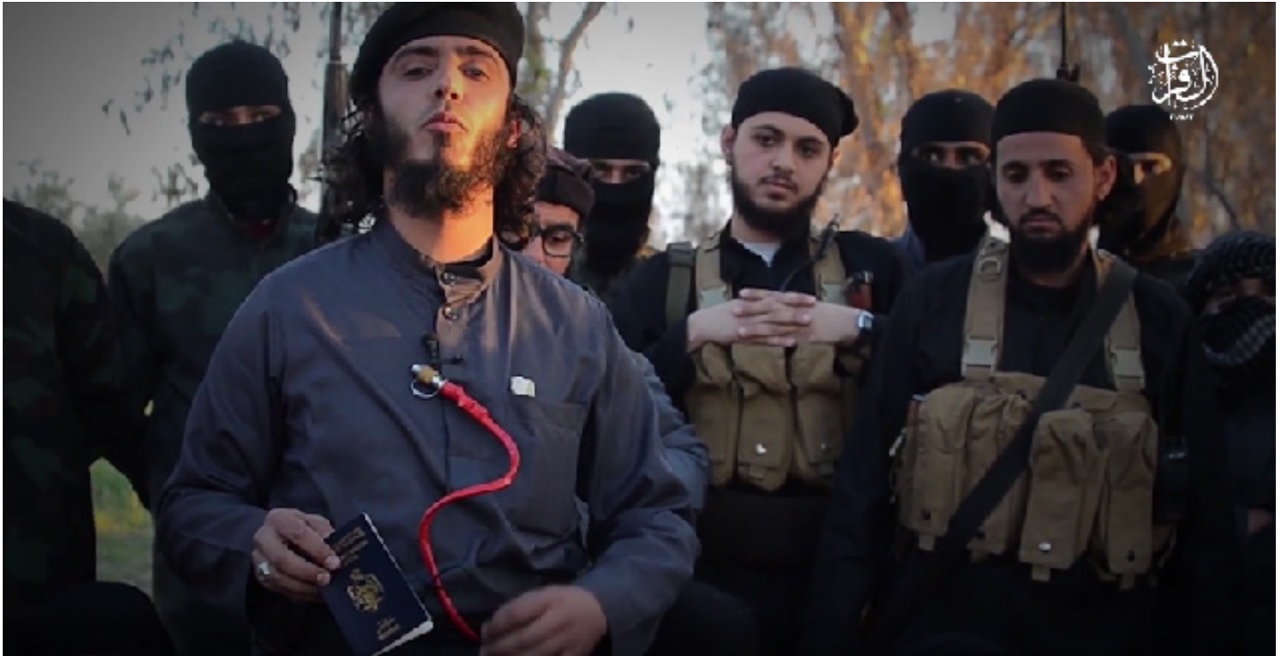
A Jordanian Islamic State fighter holds up his passport in an April 2014 Islamic State video in which fighters burned their passports.

Beyond these attacks lurk several deeper security threats. First, the discovery of an enormous arms and explosives cache maintained by the Karak terrorist cell revealed the ease with which militants can obtain weaponry today. 13 Jordan has been saturated with arms since it began supporting Western-backed Syrian rebels by serving as a key training and supply route. While weapons smuggling has surged, so too have thefts of combat supplies. In the largest known case to date, huge CIA shipments of U.S.- and Saudi-supplied arms were reportedly stolen and resold on the black market, including some that investigators believe were used in the November 2015 attack that killed Americans. 14 Second, while recent terrorism involved just a few dozen attackers, there is a far larger pool of extremists and thus potential terrorists. Each successive attack suffered over the past year was followed by security crackdowns rounding up hundreds more suspected militants. By one estimate, for example, the police and GID arrested 700 suspected jihadis in the two months following the December 2016 Karak siege. 15